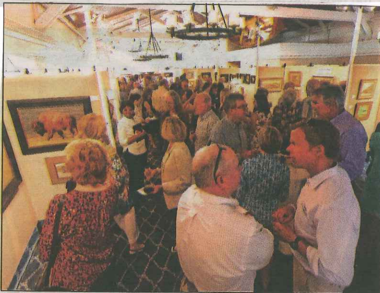
Last year's Wild Side art show drew a large crowd.