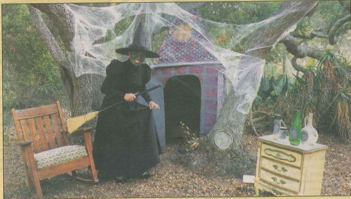
The wicked witch is coming back to Catalina. She will be back this year to entertain guests at the Halloween in the Garden on Oct. 27. More than 700 guests attended last year's event.